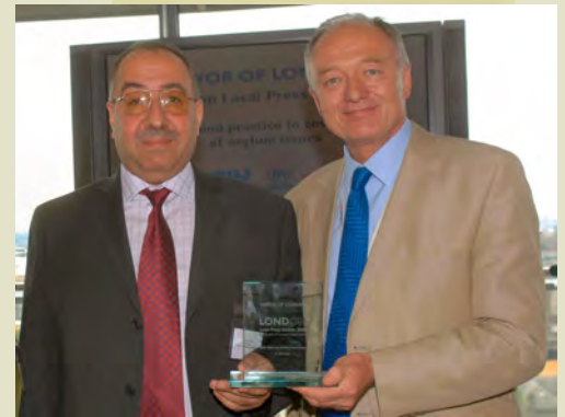
The Mayor of London Award 2005