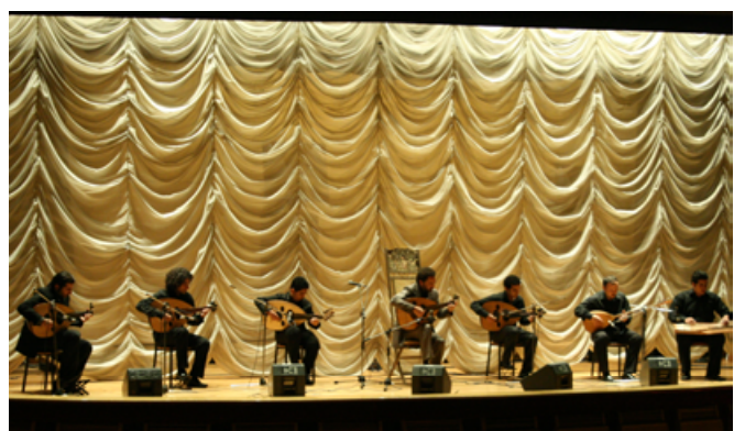
Concert at the Syndicate of Journalists with Naṣīr Shamma and Beit al-‘ūd Ensemble (April 2009)